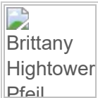
Brittany Hightower Pfeil

Brittany Hightower-Pfeil - February 19, 2018 at 09:28 PM