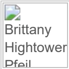
Brittany Hightower Pfeil

Brittany Hightower-Pfeil - February 19, 2018 at 09:31 PM